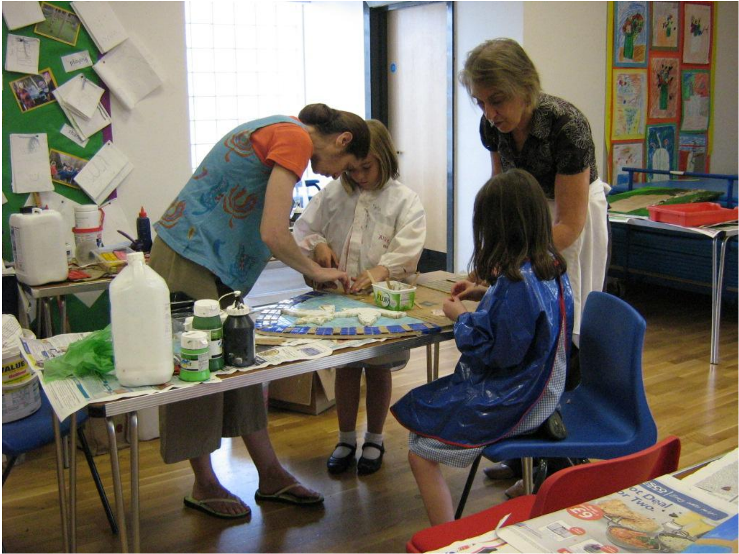
All members of the school community helped with this mosaic: children, staff, parents, governors, local people etc.