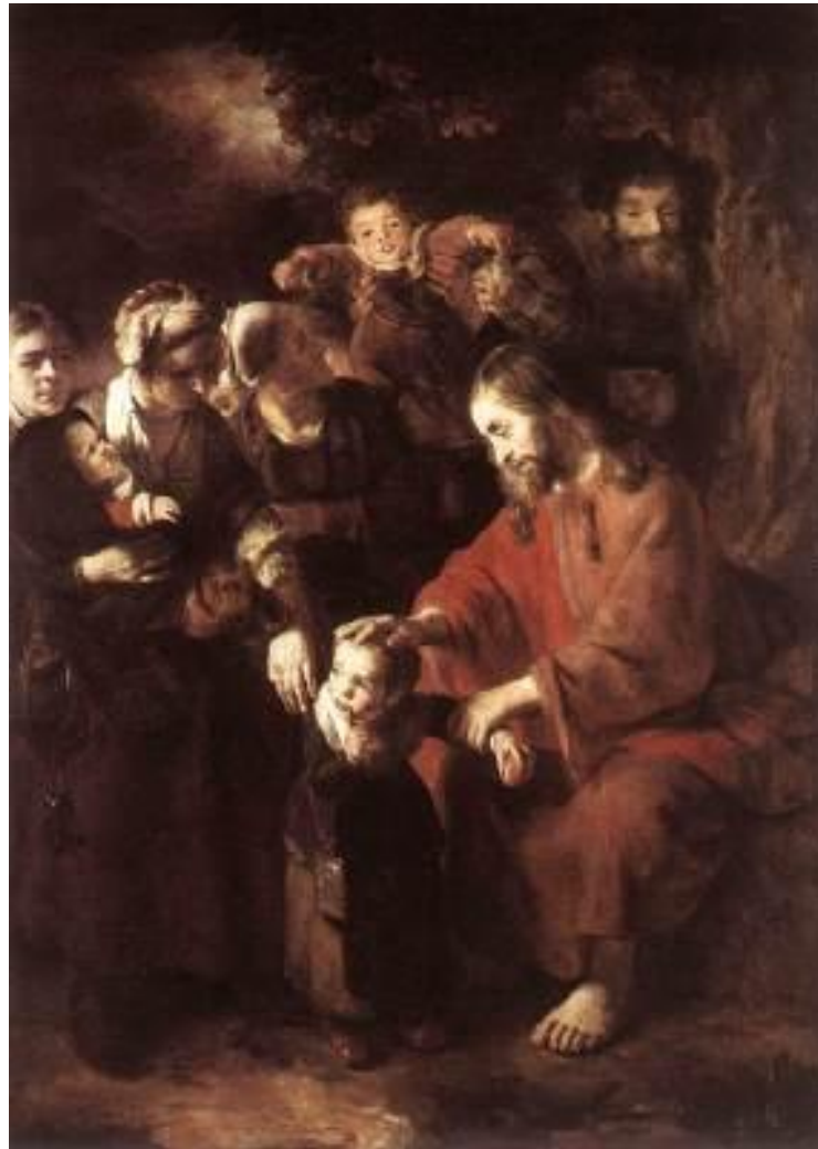
Nicholas Maes 'Christ blessing the Children'

We want to provide the children with all they need to be happy here.